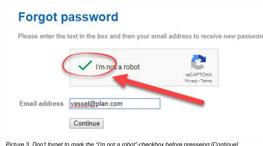
Picture 3. Don’t forget to mark the “I’m not a robot”-checkbox before presseing [Continue].

The function for “Forgot your password” when trying to login is now functional again. When using it don’t forget to mark the “I’m not a robot”-checkbox before typing your e-mail address and pressing [Continue] (Picture 3).